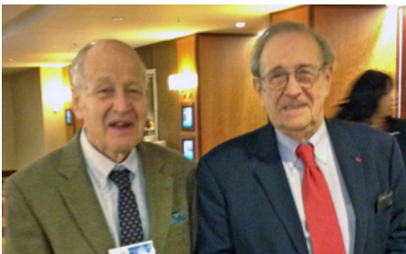
Dr. Samuel L. Katz (left) and Dr. Stanley A. Plotkin attend the 15th Annual Conference on Vaccine Research

The three-day conference, devoted to vaccines and related technologies for disease prevention and treatment, focused on basic science and clinical research in both human and veterinary medicine. The ACVR is the premier venue for cutting-edge presentations and networking for scientific collaboration in vaccine research.