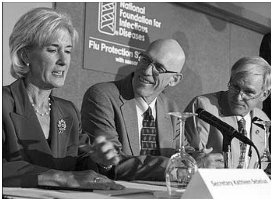
Secretary of Health and Human Services Kathleen Sebelius gives the keynote address at the Annual Influenza/Pneumococcal News Conference.

In addition to the news conference held in early September at the National Press Club in Washington, DC and other broadcast media activities, NFID’s influenza-related efforts have included consumer research to measure current influenza attitudes and